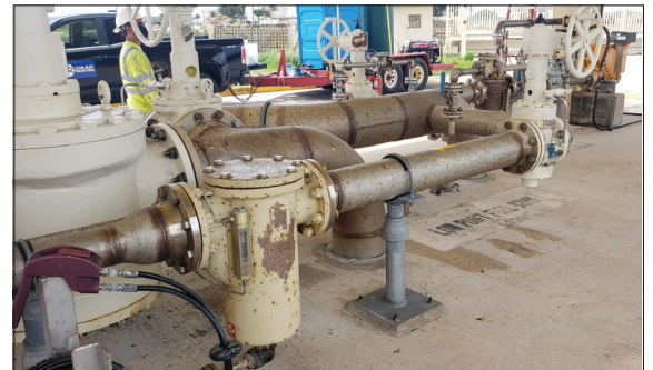
Before corrosion control was performed at Andersen Air Force Base, Guam.