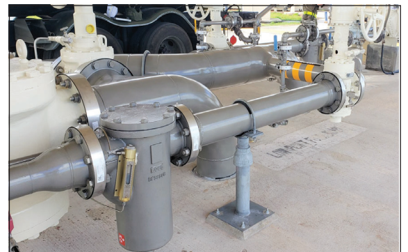
After corrosion control was performed at Andersen Air Force Base, Guam.