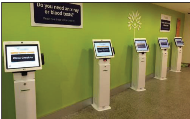
Shown is a hospital wayfinding system.