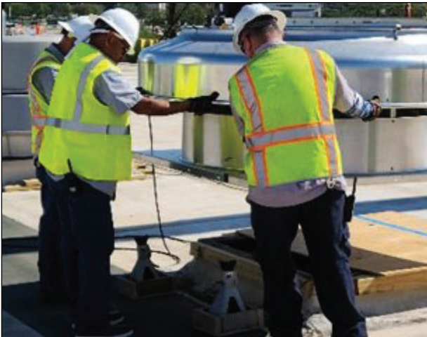
Technicians Install new Central Utility Plan Exhaust Fans at the Military and Family Support Center, Fort Cavazos, Texas.

Performing routine preventative and on-demand corrective maintenance increases the facility operability rate and decreases the amount of time and money associated with extensive repairs.