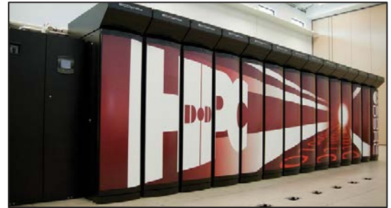
Technical Insertion (Cray Computer)