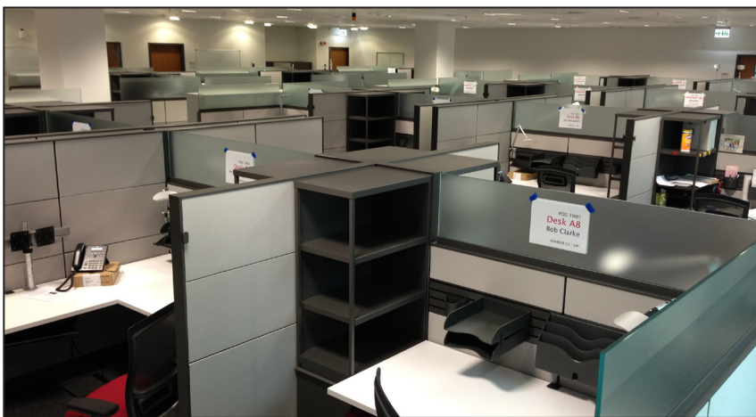
U.S. Army Europe Headquarters workstations at Clay Kaserne, Germany.