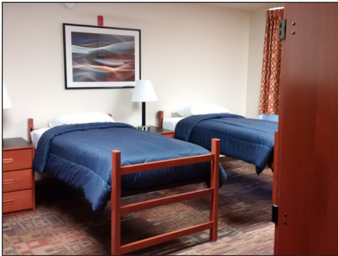
Navel Airstation Jacksonville, Florida

A variety of services for both continental United States and overseas requirements is provided to many federal agencies. For example, for the Assistant Chief of Staff for Installation Management (ACSIM) and IMCOM, services provided by Huntsville Center include assisting in annual budgeting and work plan formulation; preparing and executing the acquisition plan for worldwide procurement of furniture, fixtures and equipment (FF&E); developing and maintaining current minimum quality specifications for all furniture requirements; evaluating and awarding supply and services contracts to vendors offering the best solution to the government; managing the delivery of the contract to coincide with the often dynamic beneficial occupancy date; measuring and evaluating program efficiency and cost effectiveness; serving as the clearing house for end user comments and lessons learned; and recommending or implementing improvements to program management and acquisition strategies. Our team focuses on Administrative, Barracks and Lodging Furnishings.