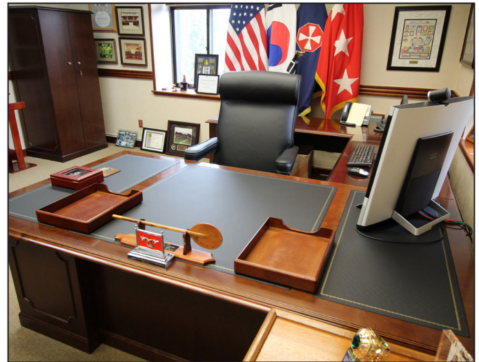
Camp Humphries Korea Executive Office

The Furnishings Program's primary mission is to buy furnishings in accordance with customer requirements and to manage the delivery of those items to the new or renovated facility by the beneficial occupancy date (BOD).