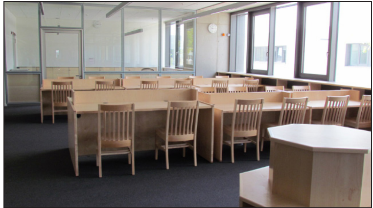
Department of Defense Education Activity classroom and library at Stuttgart Elementary and High School in Germany.

The Furnishings Program is a success because of its strategic acquisition and planning approach, ability to reduced procurement costs and providing outstanding quality products to our customers. The program has generated a cost savings of over 17% since conception. Our customers are able to fund additional requirements with the cost savings.