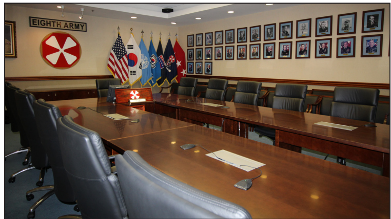
Camp Humphries Korea Executive Conference Room