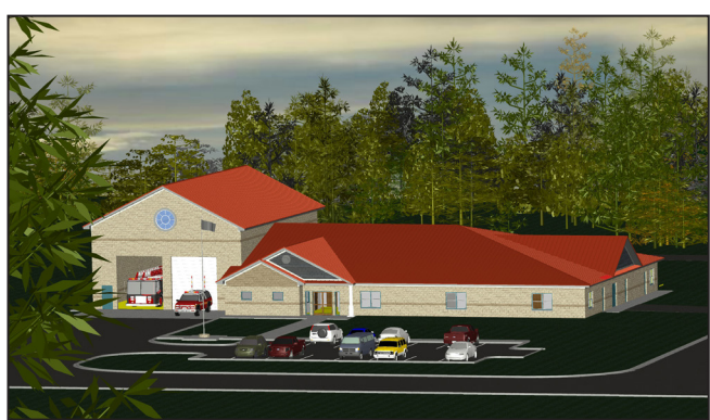
Rendering of a standard-design fire station.