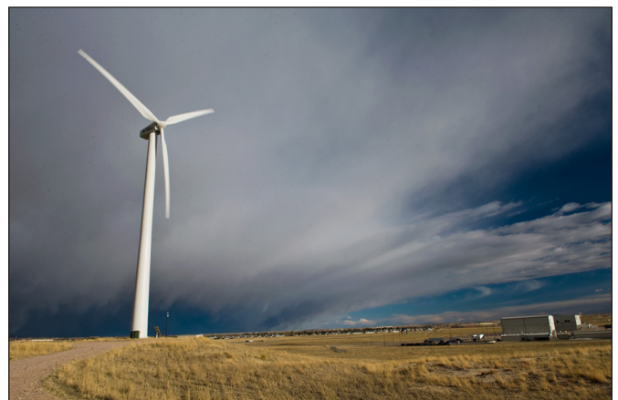
EEAP helps facilitate and identify potential projects.