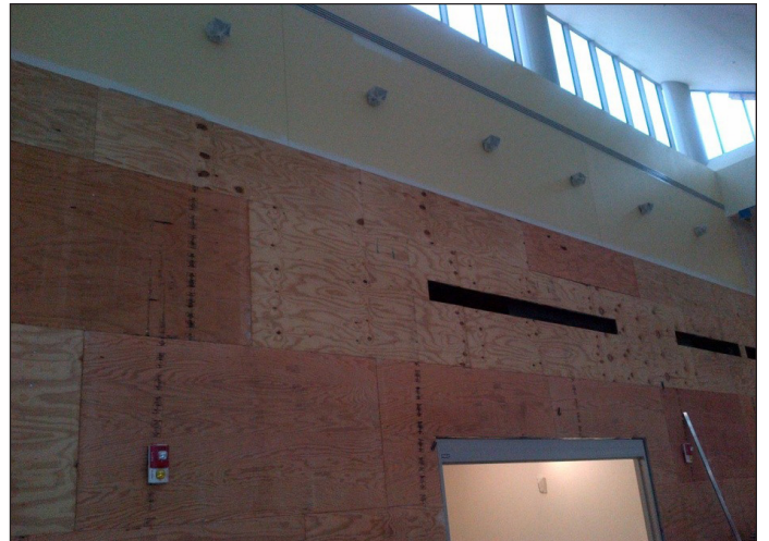
Pictured are two angles from inside Martin Army Community Hospital at Fort Benning, Georgia.

U.S. Army Corps of Engineers – Engineering and Support Center, Huntsville