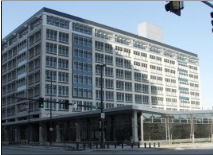
Zorinsky Federal Building

With involvement from the Corps, however, the estimated cost savings was between $150,000 and $450,000.