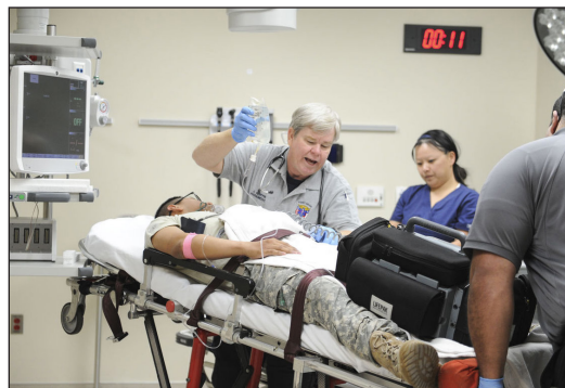
Paramedic and emergency room staff conduct trauma exercises in preparation of the new Carl R. Darnall Army Medical Center.

functions to new locations including day-in-the-life training exercises.