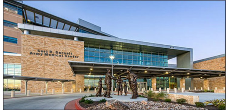
Huntsville Center's IO&T Team supported the opening of the Carl R. Darnall Army Medical Center at Fort Hood, Texas. At nearly 1 million square feet, it's the largest Army replacement hospital to date.