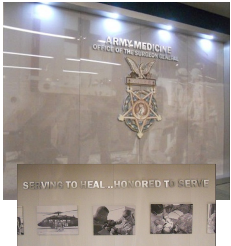
Signage and graphics installed at the Office of the Surgeon General in Falls Church, Virginia.

The MO&T-Sustainment Team supports Army Medical Command facilities worldwide. This team provides Integrated Modular Medical Support Systems, non-Modular Medical Furniture and artwork for hospitals, clinics, pharmacies, laboratories, dental clinics, veterinary clinics, administrative and logistical facilities. IMMSS Systems available through the MO&T-Sustainment Team allow for integrated facility solutions with the flexibility to accommodate changing medical technology and functional requirements. Products are modular and capable of being reconfigured and relocated anywhere within the facility, avoiding obsolescence because of changes to operations, equipment and personnel needs. They are durable, flexible and safe, have a professional appearance and are functional within a health care setting. Many medical facilities have simultaneous requirements for IMMSS and requirements for non-IMMSS furniture and furnishings, like wood furniture and case goods, artwork, waiting room furniture and lounge furniture.