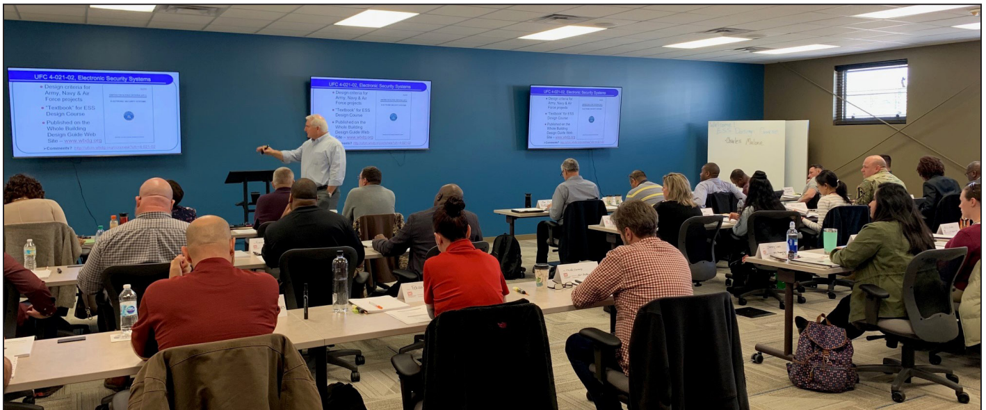
Pictured is the ESS Design Course in March 2019.

The ESS-MCX provides technical support services to the Army.