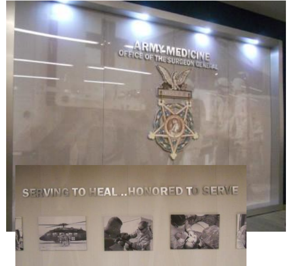
Signage and graphics installed at the Office of the Surgeon General, Falls Church, Virginia.

The MO&T-Sustainment Team supports Army Medical Command (MEDCOM) facilities worldwide and all Department of Defense Services as part of the shared services associated with the Defense Health Agency (DHA). This team provides Integrated Modular Medical Support Systems (IMMSS), non-Modular Medical Furniture and artwork for hospitals, clinics, pharmacies, laboratories, dental clinics, veterinary clinics, administrative and logistical facilities. IMMSS Systems available through the MO&T-Sustainment Team allow for integrated facility solutions with the flexibility to accommodate changing medical technology and functional requirements. Products are modular and capable of being reconfigured and relocated anywhere within the facility, avoiding obsolescence because of changes to operations, equipment and personnel needs. They are durable, flexible and safe, have a professional appearance and are functional within a health care setting. Many medical facilities have simultaneous requirements for IMMSS and requirements for non-IMMSS furniture and furnishings, like wood furniture and case goods, artwork, waiting room furniture and lounge furniture.