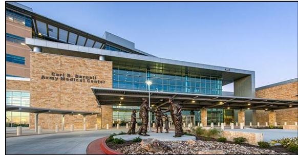
The Huntsville Center's IO&T Team supported the largest Army replacement hospital opening to date, measuring just under one million square feet and requiring 30,000 new items to support the first patient day which occurred April 3, 2016.