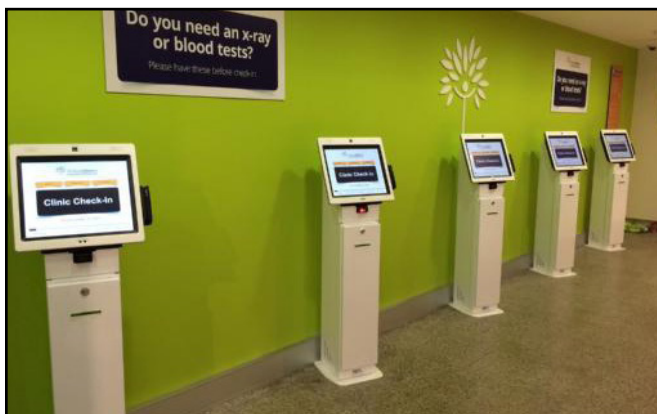
Hospital wayfinding systems