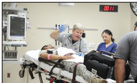
Paramedics and emergency department staff rush in a volunteer patient for a simulated trauma case during the Carl R. Darnall Army Medical Center "Day in the Life" event preparing the staff for the new facility.