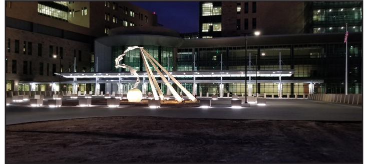
Huntsville Center's Initial Outfitting & Transition Team supported the outfitting and opening of the new William Beaumont Army Medical Center, Ft. Bliss TX, to support the first patient day in July 2021.